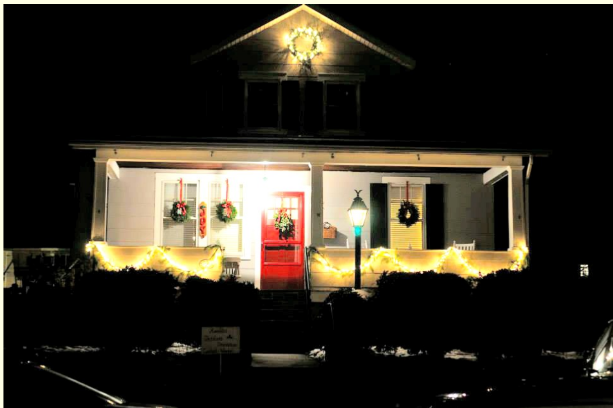
Best Traditional: 706 Murdock Road