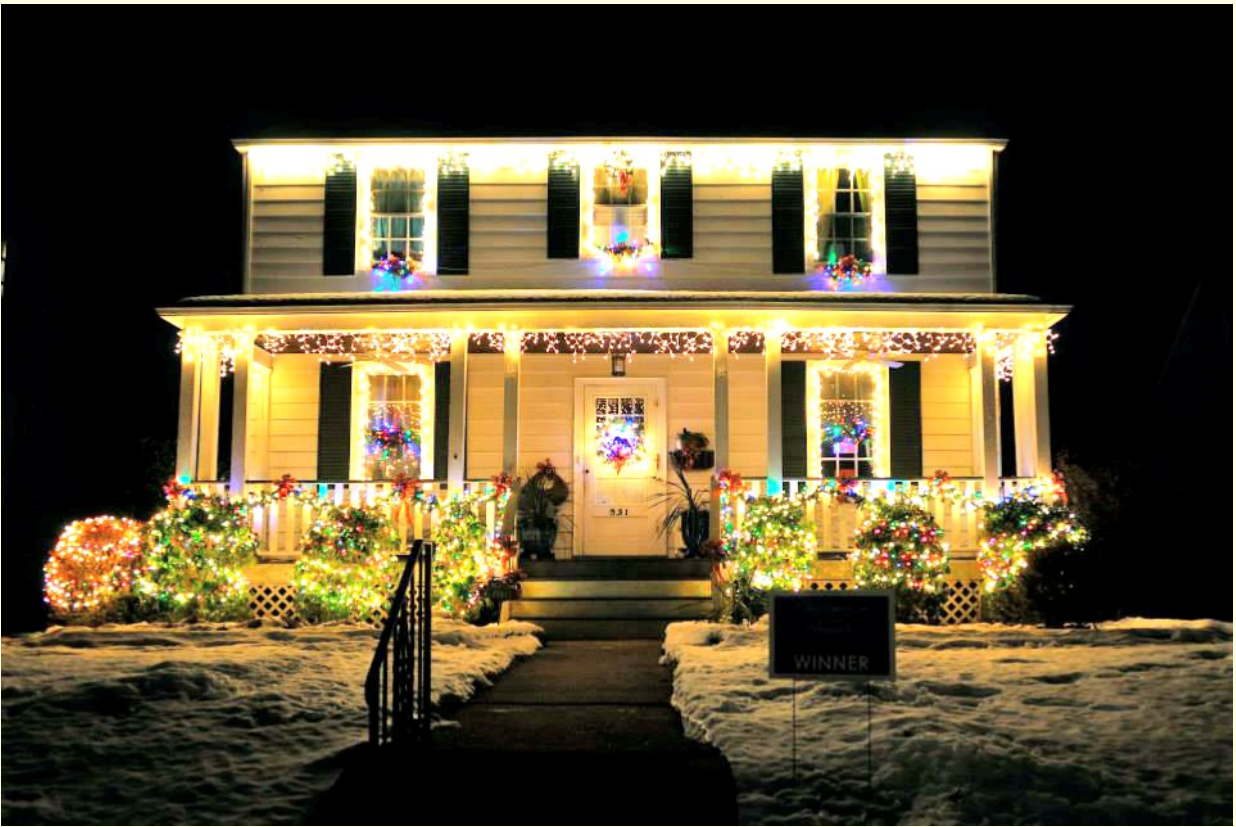
Most Illuminated: 531 Overbrook Road