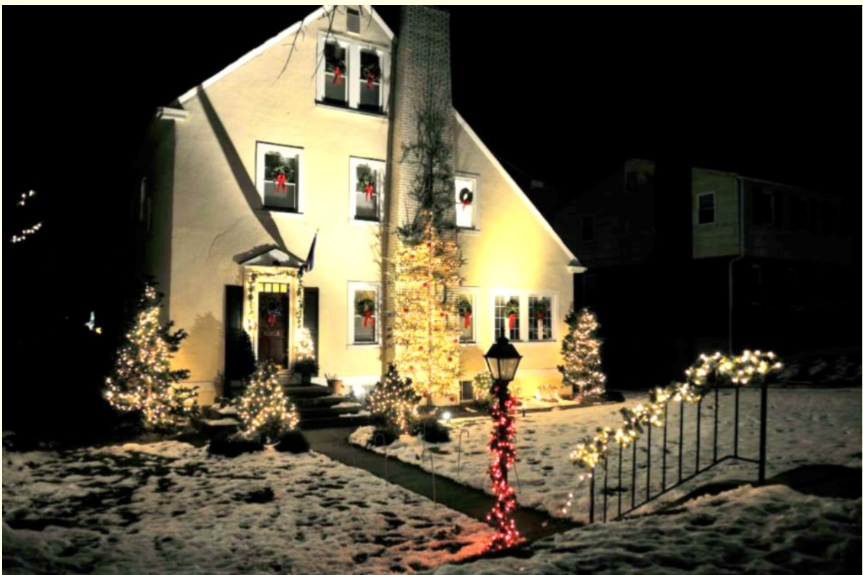
Best Theme: 521 Dunkirk Road