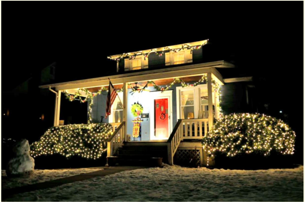
Honorable Mention: 619 Murdock Road