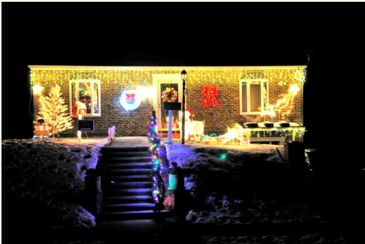
Most Commercial: 726 Overbrook Road