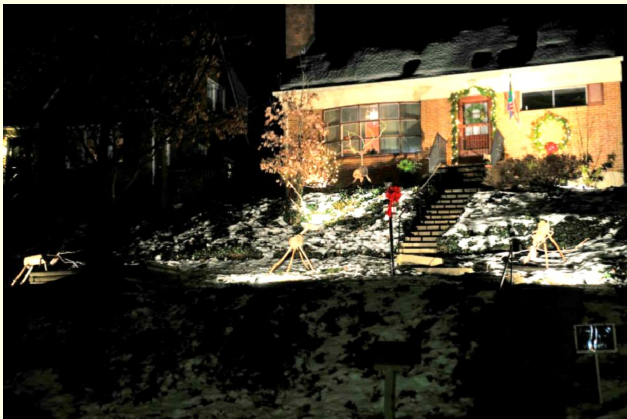
Most Creative: 721 Anneslie Road