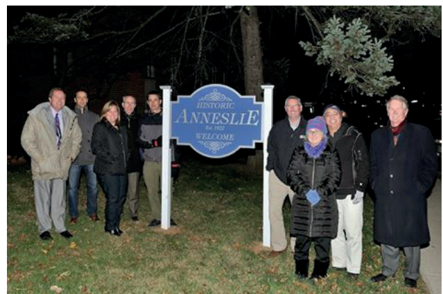
Community members dedicated the sign last November.

Vice President, Anneslie Community Association